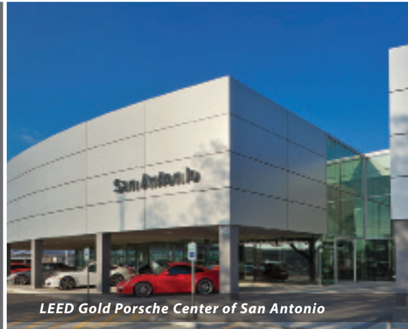
LEED Gold Porsche Center of San Antonio

Internships at Jordan Foster Construction