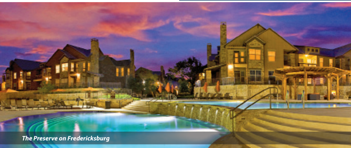
The Preserve on Fredericksburg