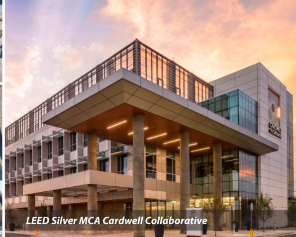
LEED Silver MCA Cardwell Collaborative