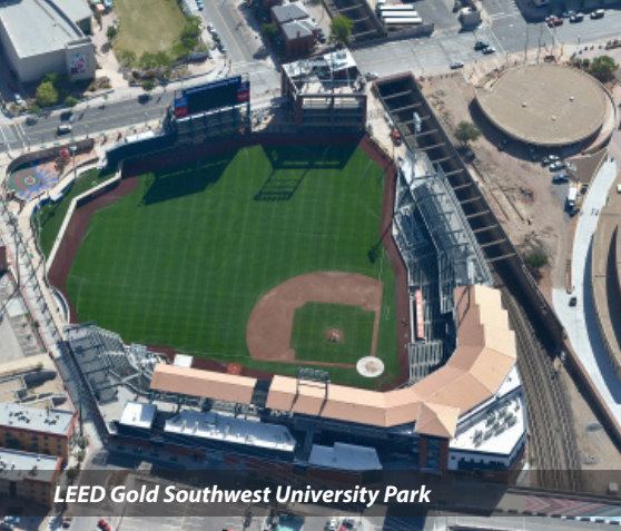
LEED Gold Southwest University Park