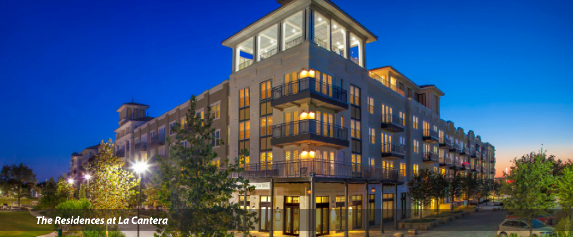
The Residences at La Cantera